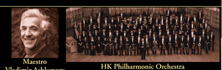
Maestro Vladimir Ashkenazy HK Philharmonic Orchestra